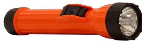
WorkSafe™ Model #2224LED