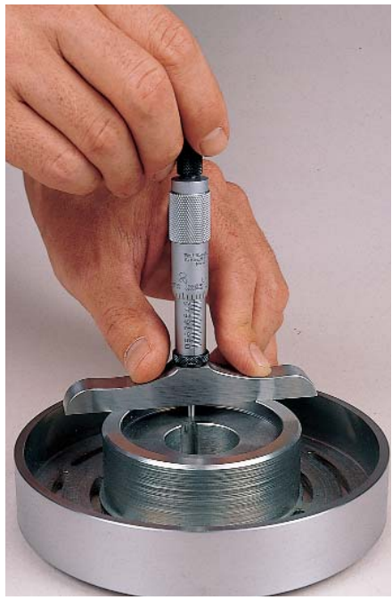
Measuring the depth of a shoulder with the No. 445AZ-3RL.