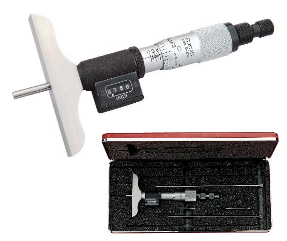
Micrometer, rods and wrenches in case.