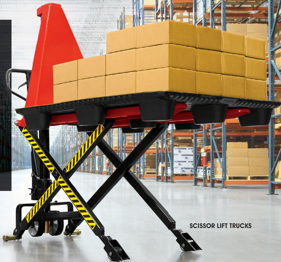
SCISSOR LIFT TRUCKS