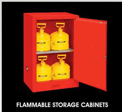
FLAMMABLE STORAGE CABINETS