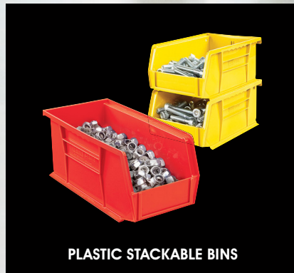
PLASTIC STACKABLE BINS